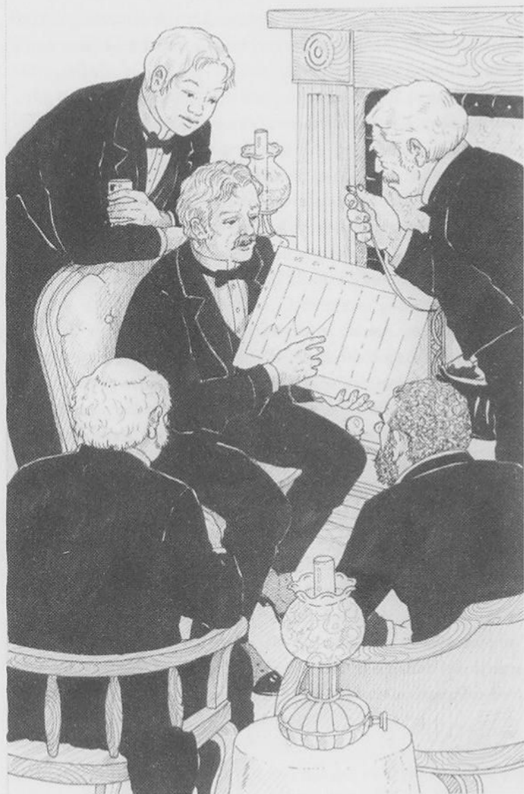
'This line shows the changes in temperature.'

'But,' said the Medical Man, looking hard at the fire, 'if time is